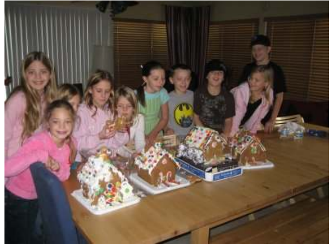
The Gingerbread House class...

Size 1 Used – Good Condition Free Contact Lisa Vaca through SDCH