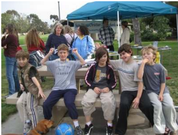
The goofy boys of Park Day

Love is in the air at February's Park Day. Please plan to join us for our annual children's Valentine exchange. Have each of you children who plan to participate bring about 24 to 36 pre-signed Valentines in a plastic or paper bag. Just have them write their name on the "from" field and leave the "to" field blank or they can write "friend" or "you" if they like. For young children it is okay if Mom or Dad writes the name on each Valentine (or use name stickers printed from your computer). Also please have each of your children who plan to participate bring a separate bag or small box (something like a shoe box or a gift-bag that will stand up on it's own – they can even decorate it ahead of time if they want to). Put the child's first and last name somewhere on this box/bag. It is for receiving Valentines from the other children so it should be empty when you arrive at Park Day (do not bring your own Valentine's to the Park in it). You will have a box (or bag) full of colorful cards and notes from friends when you leave that afternoon.