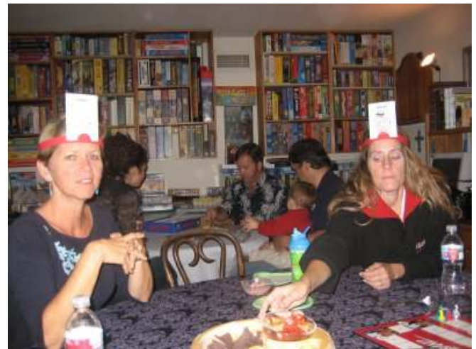
Our game nights are very dignified