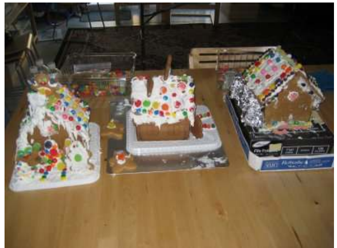
...and the fruit of their labor.