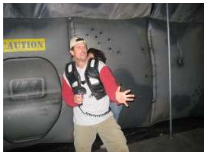
One of Our Homeschool Dads Prepares for Laser Tag at the Homeschool Boomers event