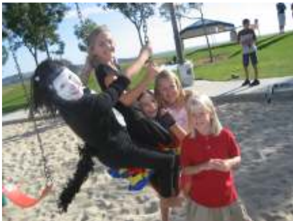
Last month's park day featured costumes

Driving Directions to Lindbergh Park: Take 805 to the Balboa Avenue exit and go West on Balboa. Turn Left on Ekstrom Avenue and turn left again to stay on Ekstrom. Ekstrom turns into Ashford. The park is there on your left.