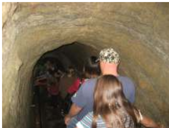
SDCHers descend into the darkness on our Cave field trip.